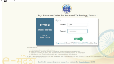
Fig. I.1.1: Snapshot of login screen.

The new email system was released to all the users in the last week of September 2017. Figure I.1.1 shows snapshot of the login screen and Figure I.1.2 shows typical screen after successful login.