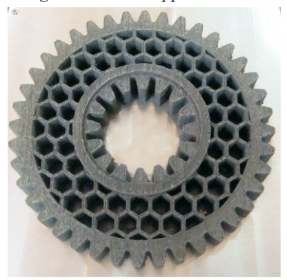
Fig. L.3.3: External and internal geared geometry with honeycomb core.

Presently, the system is being operated in open-air condition for building engineering components of oxidation-resistance alloys. Next step is to upgrade the system to operate it in controlled atmosphere condition to cater other alloys, which will enhance the system capability multifold.