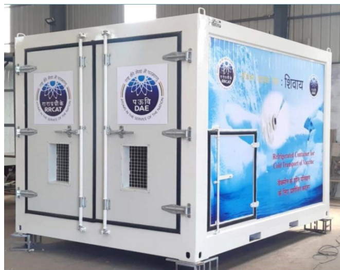
LN2 based refrigeration system - SHIVAY-V.