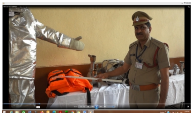
Online fire fighting demonstration for National Science Day-2021 celebration.

For National Science Day-2021 event this year, videos on fire safety awareness and fire demonstrations were shown during the on-line celebration with school / college students and RRCAT employees.