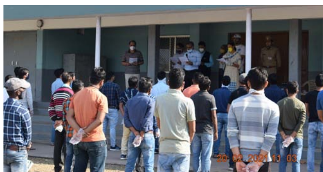
Swachhata pledge being administered to volunteers on February 20, 2021 during Swachhata Pakhwada.

As part of celebration of the “Swachhata Pakhwada-2021”, the cleanliness drive for the colony was taken up with enthusiastic participation of the residents of the colony as well as AECS teachers, RRCAT employees, CISF personnel, students and trainees in large numbers. Further, in the two workshops, talks were delivered in Hindi on the broad topic of “Hygiene & cleanliness issues in the current scenario of COVID-19” by the doctors of RRCAT Medical Centre.