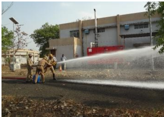
A photograph of fire mock drill.

Fire and Safety Cell is regularly conducting safety awareness and skill enhancement program for the crew members and also for RRCAT employees. In spite of COVID-19 pandemic, 85 RRCAT employees were trained in first aid fire-fighting training following COVID-19 protocol. Further, two fire mock drill were also conducted at RRCAT Central Complex sub-station (diesel generator sets) and oil storage yard of IRSU.