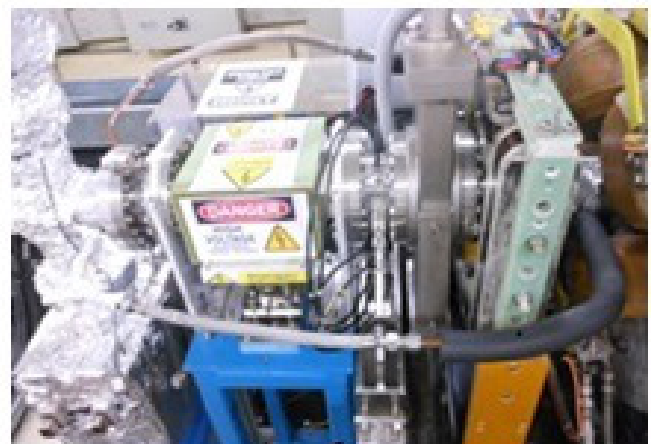
Fig. A.1.3: Horizontal pinger magnet installed in Indus-2.

Utilization: Users from various universities, research institutes and national laboratories used the SR beam at beamlines in Indus-1 and Indus-2 for carrying out experiments. The total number of user experiments carried out at Indus beamlines was 365.